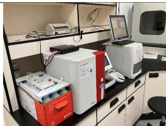
IDEXX Laboratory: IDEXX ProCyte Dx Hematology Analyzer and Catalyst One Chemistry Analyzer