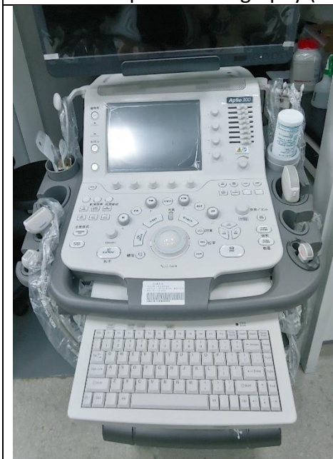
Ultrasound machine: Toshiba Aplio300