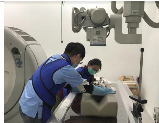
X-ray machine: TOSHIBA Aquilion TSX-101A