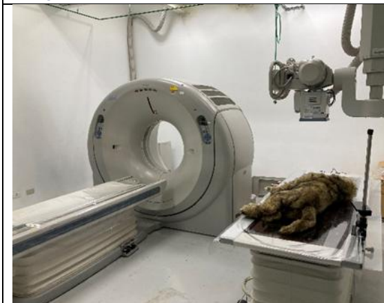
64 slice Computed Tomography (CT)