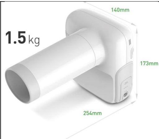
Mobile Dental X-ray